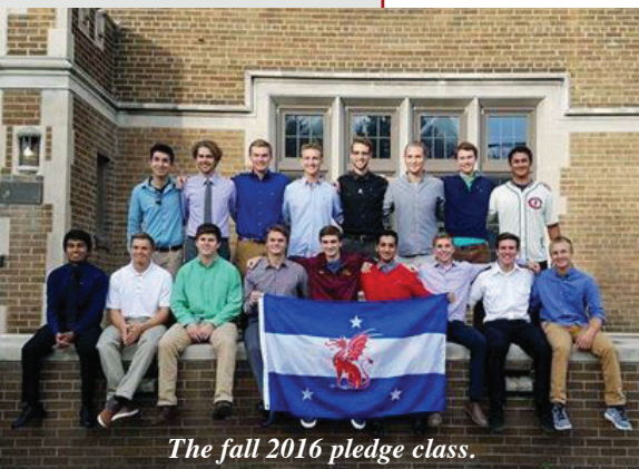
The fall 2016 pledge class.

To join the mailing list for future events and communication, e-mail betathetapi.minnesota@gmail.com.