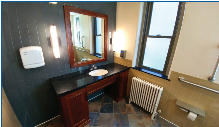
Inside the brand-new first-floor men's room.