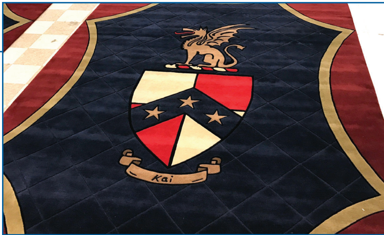
New Beta badge rugs welcome visitors to the enhanced chapter house.