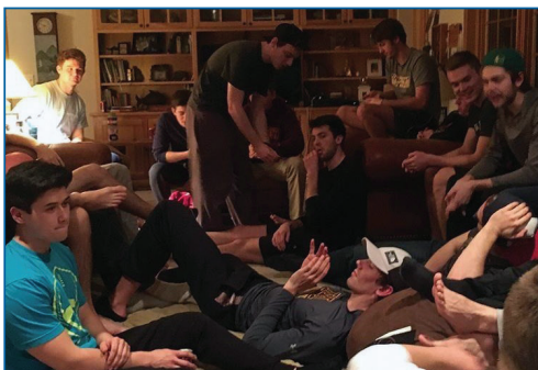
Brotherhood weekend in Chanhassen, Minn., included a traditional game of mafia.

Our chapter co-hosted Purple RAINN with Alpha Chi Omega, a grill-out event to raise money and awareness for sexual assault. We took part in Walk a Mile in Her Shoes, another event designed to raise awareness for this cause. As a fraternity, we work actively to fight on-campus stigmas regarding sexual assault.