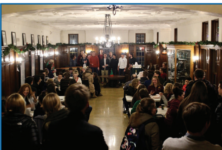
Our annual holiday season philanthropy event, Light the Row, drew a big crowd.