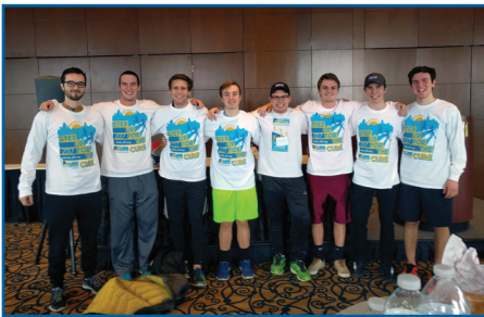
Members get involved in Step Up for the Cure to support the Cystic Fibrosis Foundation.