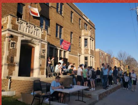
Beta Pi hosts our annual Beta Theta Pies philanthropy event on April 21. Guests were invited to donate and throw whipped cream pies at brothers. We raised over $3,000 in support of the Aurora Center for Sexual Violence in this event alone!