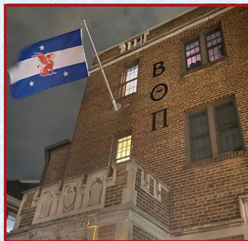
A new set of Beta Theta Pi letters are added to the front of the chapter house in September, replacing the former set.

We are now in an information-gathering stage and will be making a plan in the months to come.