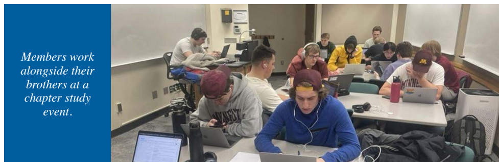
Members work alongside their brothers at a chapter study event.