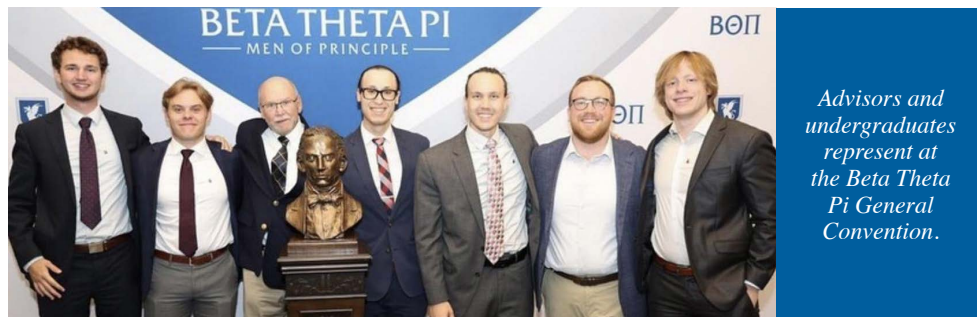
Advisors and undergraduates represent at the Beta Theta Pi General Convention.