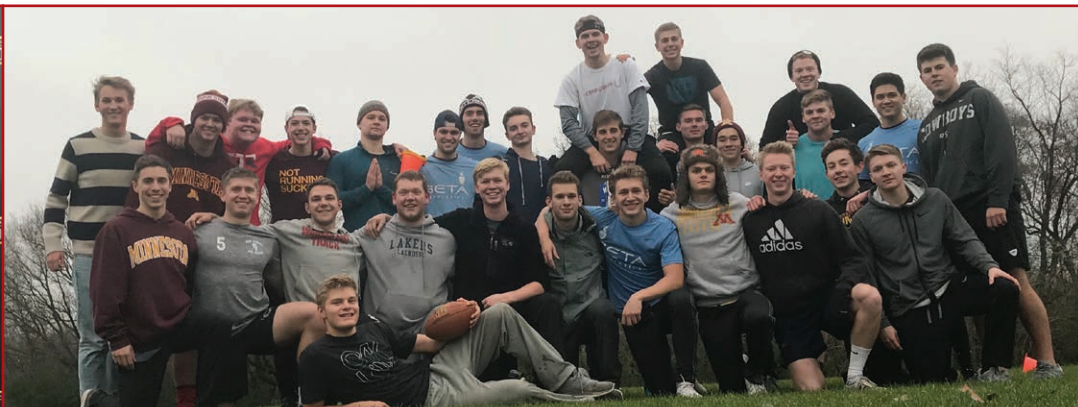
The biannual brotherhood weekend football game is a great way to bring Beta Pis together.