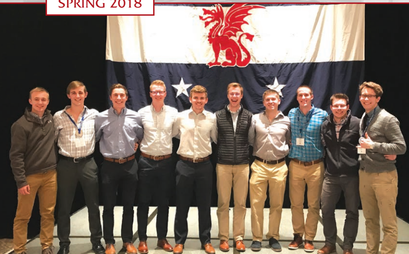
The 2018 executive team at the Keystone Regional Leadership Conference.