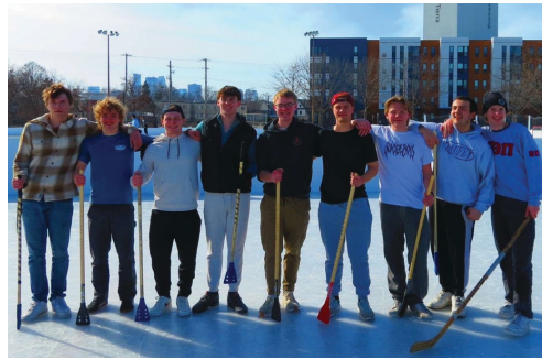
Brothers play a friendly game of broomball during a brotherhood weekend.